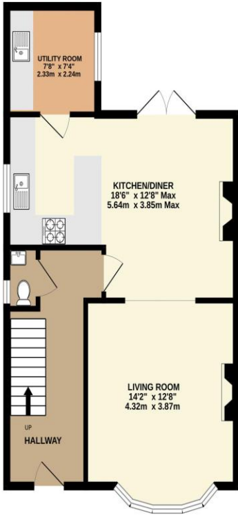
GROUND FLOOR 546 sq.ft. (50.7 sq.m.) approx.