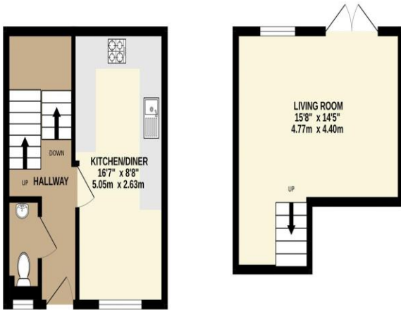
GROUND FLOOR 436 sq.ft. (40.5 sq.m.) approx.