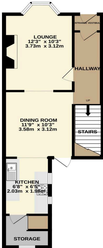
GROUND FLOOR 469 sq.ft. (43.5 sq.m.) approx.