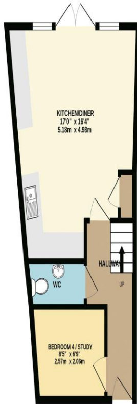
GROUND FLOOR 375 sq.ft. (34.9 sq.m.) approx.