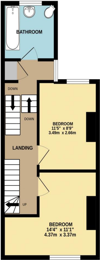
1ST FLOOR 379 sq.ft. (35.2 sq.m.) approx.