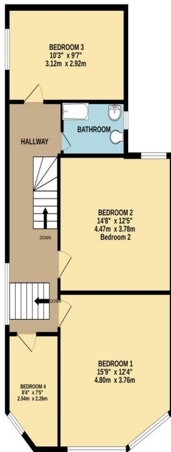
1ST FLOOR 765 sq.ft. (71.1 sq.m.) approx.