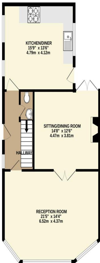
GROUND FLOOR 764 sq.ft. (70.9 sq.m.) approx.