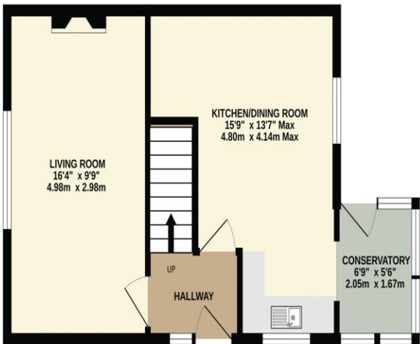
GROUND FLOOR 408 sq.ft. (37.9 sq.m.) approx.