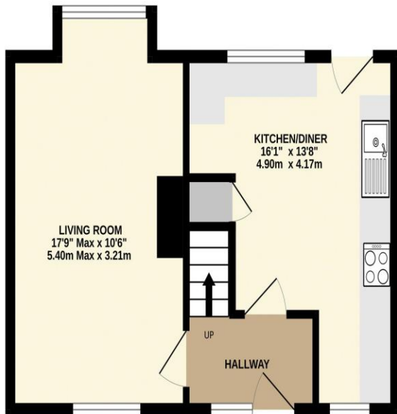
GROUND FLOOR 368 sq.ft. (34.2 sq.m.) approx.