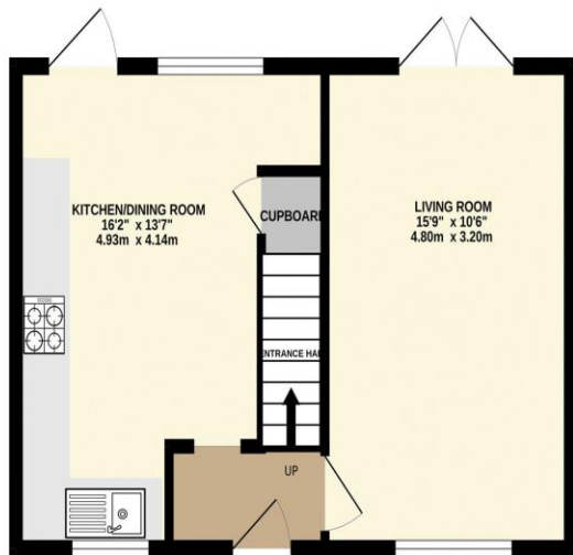
GROUND FLOOR 385 sq.ft. (35.8 sq.m.) approx.