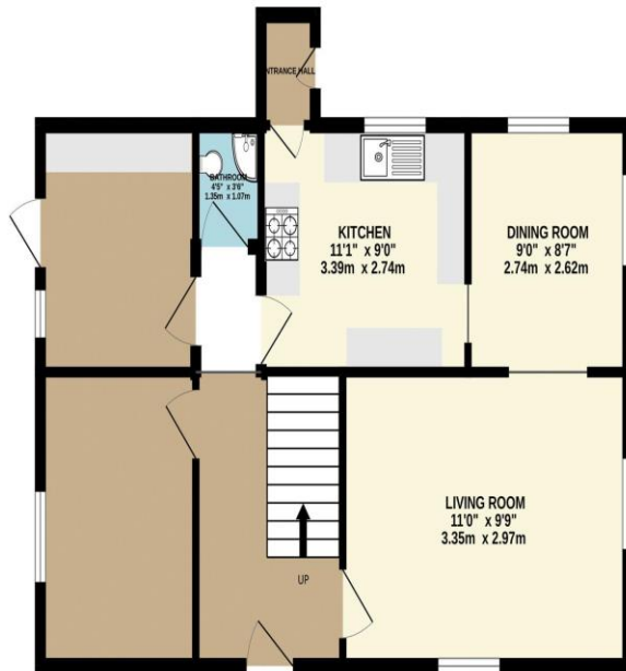
GROUND FLOOR 617 sq.ft. (57.3 sq.m.) approx.