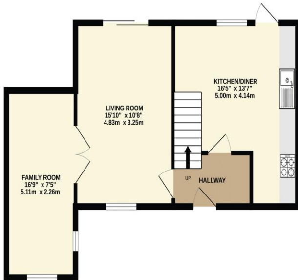
GROUND FLOOR 503 sq.ft. (46.7 sq.m.) approx.