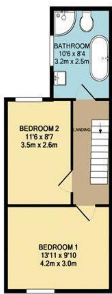
1ST FLOOR APPROX. FLOOR AREA 381 SQ.FT. (35.4 SQ.M.)

TOTAL APPROX. FLOOR AREA 760 SQ.FT. (70.6 SQ.M.) Made with Metropix ©2013