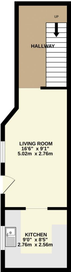
GROUND FLOOR 300 sq.ft. (27.9 sq.m.) approx.